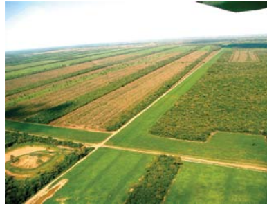
Figure 1. We see this agricultural practice underway in the Amazon River headwaters. In the upper portion bulldozers have chained the forest down in preparation for burning and lower center we see dark bands of potassium enriched soil from the ash deposited by the fires.

After recovery of the land the farmer then slashes and burns the accumulated vegetation and repeats this cycle. Hence the term Slash and Burn (Swidden) agriculture. Now prominent scientists are advocating a replacement with a new kind of agriculture - Slash and Char. A growing system that also has advantages in the temperate zone.