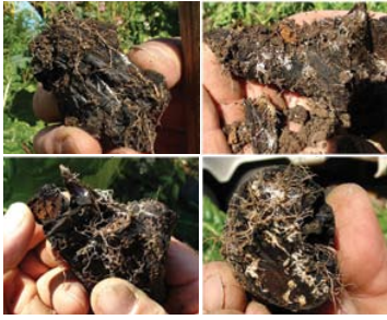
Figure 4. Here is the result of charcoal pretreatment. These charcoal pieces were left large for ease of observation and composted with urine, wood chips, cooking drippings other food waste. After several months the initially hydrophobic charcoal became water saturated and home for fungi and many macroscopic invertebrates. Several more months in soil with Swiss chard revealed plant roots actively growing into charcoal pore spaces. pretreatment research by Larry Williams