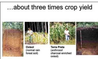
Figure 2. Cutaway view of tropical soils showing on left the normal rain forest soil where nutrients are transient and the Terra Preta de Indio soils with black carbon that is now attributed to human activities of transport of food, waste, and fuel at pre-historic dwelling places. Image credit Julie Major, plate taken from PowerPoint presentation by Folke Gunther cited in additional readings below

There is another type of tropical agriculture called slash and char which would promote soil fertility, allow for shorter rotation periods and also reduce dependence on chemical fertilizers. This farming technique was formerly practiced by the Amerindian people 500 to 2500 years ago was discovered independently in Asia. It is quite a simple concept actually, as these native Amazon Rainforest farmers had only stone tools and felling the forest for fresh, fertile ground was very difficult. Instead, they conducted a smothered combustion of agricultural debris, and supplemented this with domestic manure and household debris. This charcoal built up in the soil over time and became a durable substitute for soil organic matter. This black carbon lasts for ten's of thousands of years in the soil as opposed to a few seasons at best. The result is a soil with chemical and biological properties that convert unproductive tropical oxisols to fertile soils that are still farmed even 1000 years after the original people have disappeared.