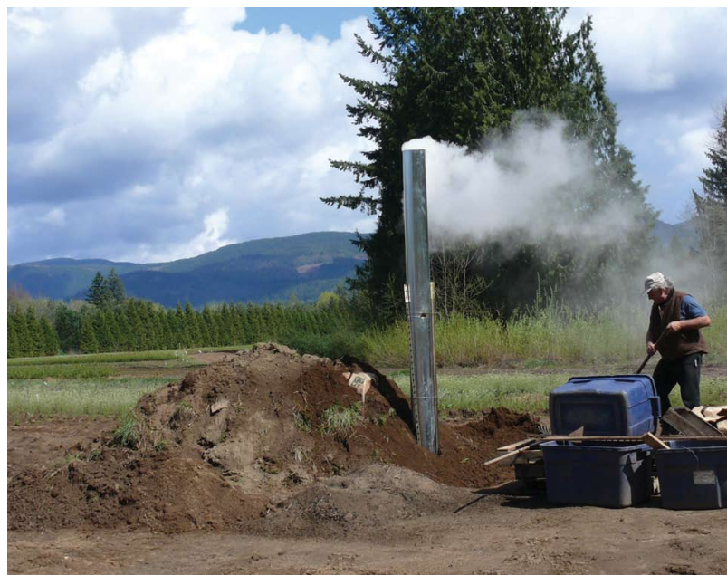
Figure 5. Our Brazil replica, top lit, bottom draft charcoal making kiln. Two cords of dry alder and maple covered with wet hay, cardboard and soil. On the third attempt it worked like a charm and gave us a 2-year supply of high quality charcoal for our research and great barbecues. See the reference below to the Flickr file for a step-by-step description.

Folke Günther, Holon Ecosystem Consultants, Lund, Sweden, Carbon sequestration for everybody: decrease atmospheric carbon dioxide, earn money and improve the soil, submitted to Energy and Environment, 3/27/2007. This article can be downloaded at: www.terrapreta.bioenergy_lists.org