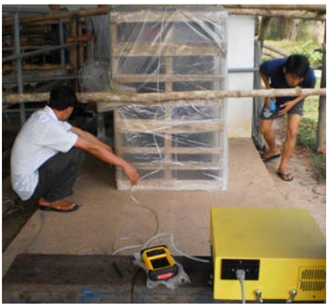
Photo 5: Wooden crates enclosed in plastic used to house the cattle during the 5 minute period of adaptation/measurement using the GASMET infra-red analyser.