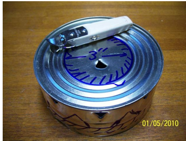
Figure 2: Crown marked for trimming

The #10 can is cut down to about 2 inches high – using tin snips and gloves (absolutely required – tin cans can slice you in the blink of an eye). First, cut off most of the excess side material, then more carefully trim one groove nice and uniform. On the sides of the Crown can, near the base, mark eight evenly spaced locations, and draw a 3-inch diameter circle in the center of the bottom, which is usually the innermost stamped ring in the bottom. Also mark eight larger equilateral triangles in the sides, reaching to about one inch of the top of the can, as shown in Figure 2.