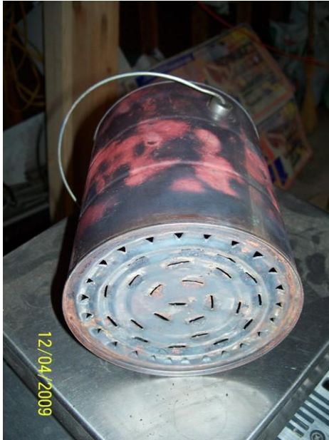
Figure 1: Can bottom