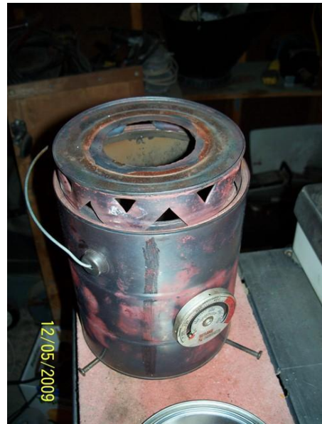
Figure 4: Completed TLUD

The last piece of the 1G Toucan is a chimney. A chimney ensures that sufficient secondary air is introduced through the side openings of the Crown and sweeps the secondary flames up through the center opening. It also improves the combustion by containing the flame in a turbulent vertical column. Figure 5 shows a 4" diameter by 24" tall chimney, using a piece of galvanized duct (from the hardware store). Alternately, a #5 can, 4" in diameter and 7" tall, can be used – this is the typical 46 ounce juice can size.