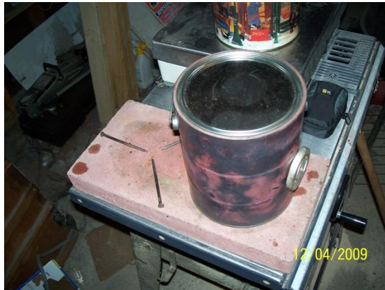
Fig. 9: Quenching char

Although the combustion has stopped, the TLUD still has to cool and that may take several hours. Alternately, the hot char can be transferred to a separate “Quench Can”, with an airtight lid to allow the char to cool in the absence of oxygen. If one transfers hot char, please wear gloves and be careful. Notice how hot the char is at the end of the burn, as shown by the thermometer in Figure 8, which is indicating over 600 Fahrenheit. If the char is placed in a Quench Can, the Toucan fuel container will cool quickly and then may be refueled and relit.