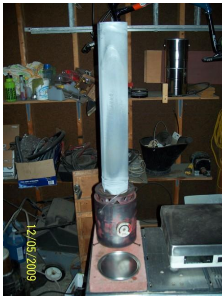
Figure 5: 4" x 24" chimney

The last piece of the 1G Toucan is a chimney. A chimney ensures that sufficient secondary air is introduced through the side openings of the Crown and sweeps the secondary flames up through the center opening. It also improves the combustion by containing the flame in a turbulent vertical column. Figure 5 shows a 4" diameter by 24" tall chimney, using a piece of galvanized duct (from the hardware store). Alternately, a #5 can, 4" in diameter and 7" tall, can be used – this is the typical 46 ounce juice can size.