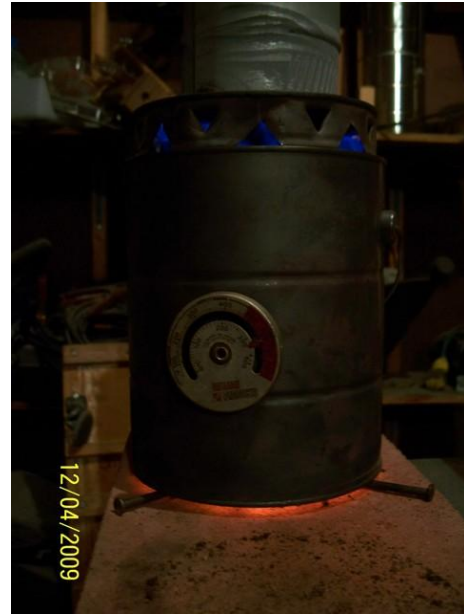
Figure 8: End of Wood Pyrolysis

Taller chimneys provide better draft and shorten the burn cycle. It turns out that shorter burn cycles also produce biochar with higher adsorption capacity, which is a desirable property. The 24" chimney is a bit much, but does produce nice biochar and completely contains the secondary combustion flames. The user can select a chimney height that produces the most aesthetically pleasing flames, especially if you plan on sitting around watching the 1G Toucan burn and, therefore, pretending you're doing something really important. Otherwise, put a tall chimney on it and check on it every so often.