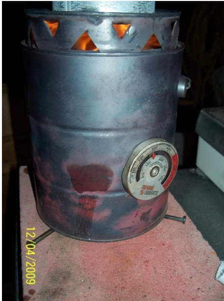
Figure 7: Half way through burn

When the pyrolysis front reaches the bottom of the fuel, two things happen; the flame turns from yellow to blue and the red pyrolysis front can be seen illuminating the bottom of the TLUD, as shown in Figure 8. At this point, all the biomass has been converted to char and wood pyrolysis ends due to the lack of additional wood fuel to gasify. For a 1G Toucan loaded with wood pellets, the wood pyrolysis (char-making) phase takes between 45 minutes and 90 minutes, depending on the height of the chimney.