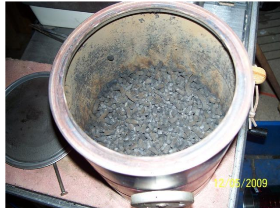
Figure 10: 1G Toucan Biochar

Once cooled, the Toucan can be emptied of biochar. The biochar is much less dense than the original wood pellets. Also, the wood shrinks during pyrolysis and the Toucan will produce about one half the original fuel volume as biochar. Figure 10 shows the finished biochar, which can be used “as is” or crushed. It is added directly to potting soils or gardens, typically at about 10-20% of the root soil volume. Remember to provide additional fertilizer at the same time with the biochar, or it will soak up all the available nutrients in the soil, and then slowly release them back to the plants. Alternately, add the biochar to an active composting process and it will be “good to go” when the composting is completed.